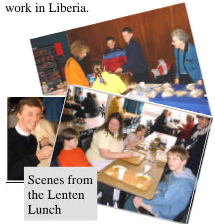
Scenes from the Lenten Lunch